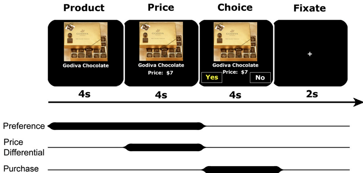
Figure 1. SHOP Task Trial Structure and Regressors

For task structure, subjects saw a labeled product (product period; 4 s), saw the product's price (price period; 4 s), and then chose either to purchase the product or not (by selecting either "yes" or "no" presented randomly on the right or left side of the screen; choice period; 4 s), before fixating on a crosshair (2 s) prior to the onset of the next trial. In regression models, preference was correlated with brain activation during the product and price periods, price differential was correlated with brain activation during the price period, and purchasing was correlated with brain activation during the choice period.