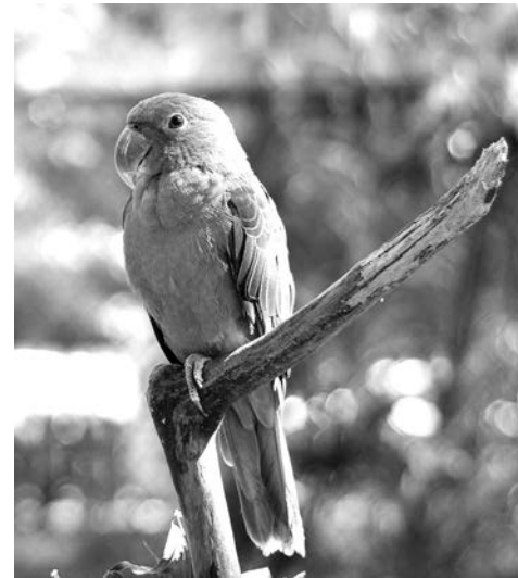
a \cdot f[x, y]

Scaling in the \gamma -domain is equivalent to scaling in the linear luminance domain