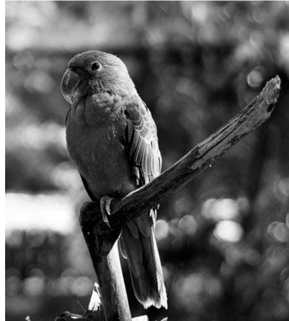
\gamma increased by 50%