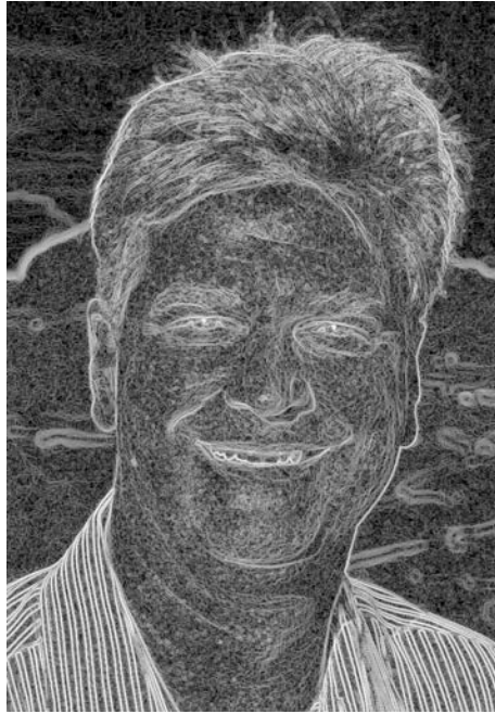
Sum of squared horizontal and vertical gradients (log display)