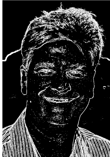
threshold = 100