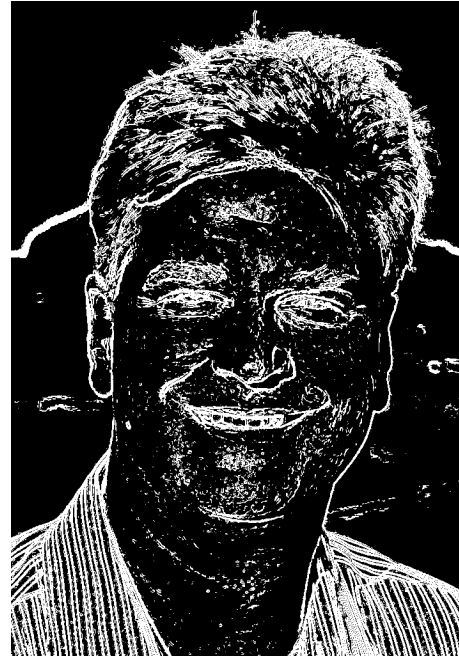
threshold = 1600