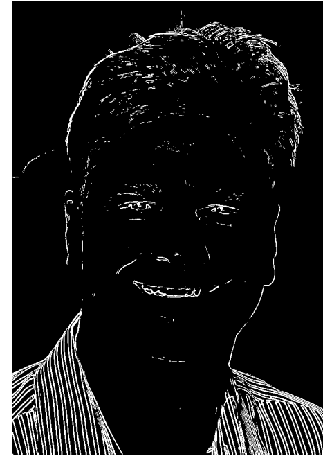
threshold = 7200