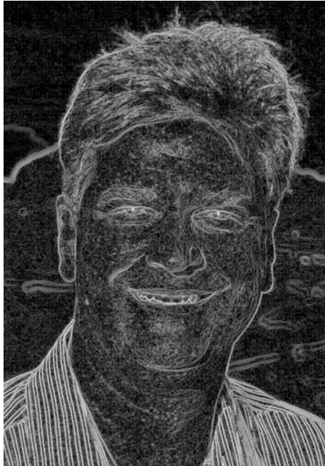
Sum of squared diagonal gradients (log display)