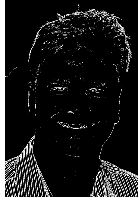
threshold = 500