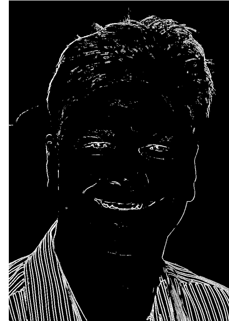
threshold = 12800