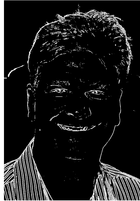
threshold = 4500