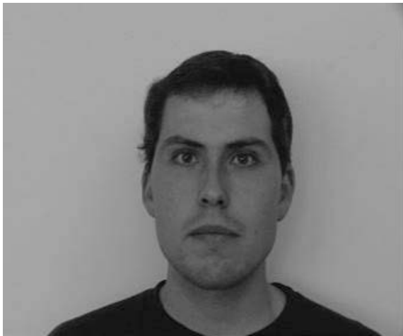
Original image Peter f[x,y]