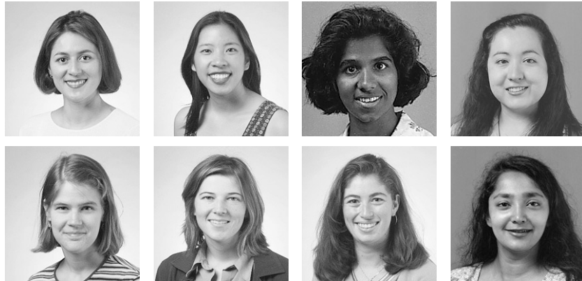
Female face samples