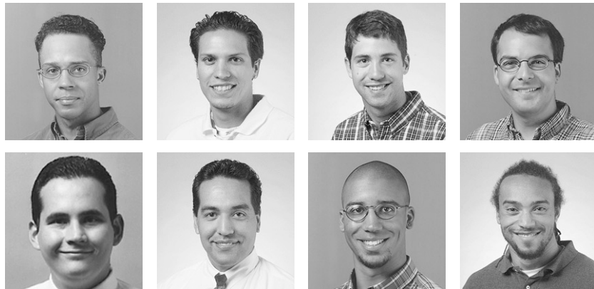
Male face samples