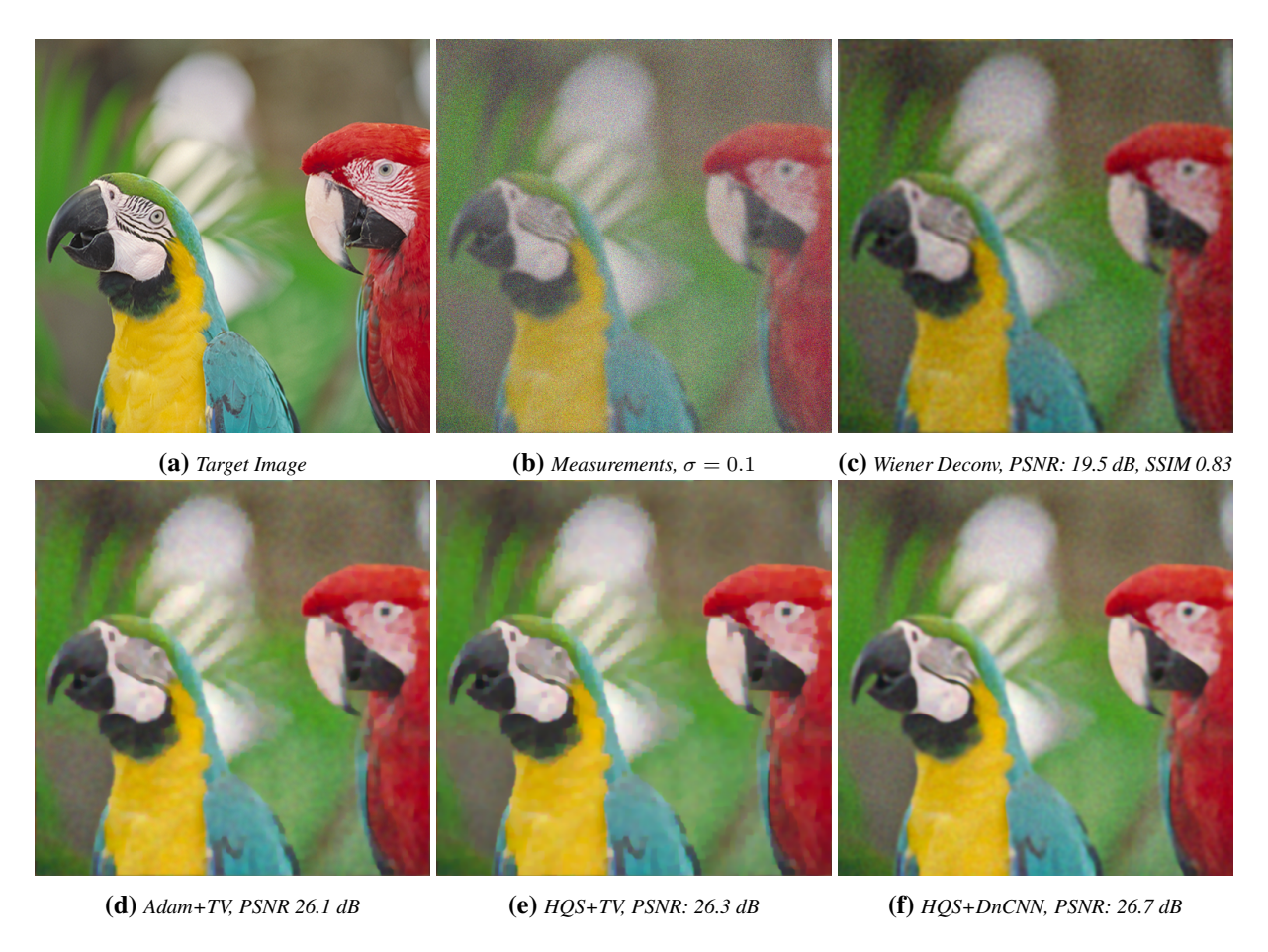
Figure 3: Results. A target image (a) is degraded by blurring it and corrupting the measurements with additive Gaussian noise with \sigma = 0.1 (b). Conventional approaches, including Wiener deconvolution fail at estimating a high-quality reconstruction (c). The Adam solver of the PyTorch package combined with an isotropic TV regularizer does a much better job at recovering the image (d). The HQS solver with a TV regularizer achieves somewhat comparable results to Adam (e). However, HQS is flexible in allowing arbitrary denoisers to be used as regularizers, such as DnCNN. For this example, HQS with DnCNN (f) achieves the best results both qualitative and quantitatively, as measured by the peak signal-to-noise ratio (PSNR).

allow \rho to gradually increase over time. Writing a training curriculum for these parameters manually is really tricky, so learning them can be very helpful.