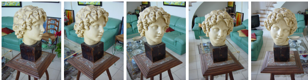
Figure 2: The set of images used in this structure from motion reconstruction.

Structure from motion is inspired by our ability to learn about the 3D structure in the surrounding environment by moving through it. Given a sequence of images, we are able to simultaneously estimate both the 3D structure and the path the camera took. In this problem, you will implement significant parts of a structure from motion framework, estimating both R and T of the cameras, as well as generating the locations of points in 3D space. Recall that in the previous problem we triangulated points assuming affine transformations. However, in the actual structure from motion problem, we assume projective transformations. By doing this problem, you will learn how to solve this type of triangulation. In Course Notes 4, we go into further detail about this process. You will implement the methods in p4.py and complete the following: