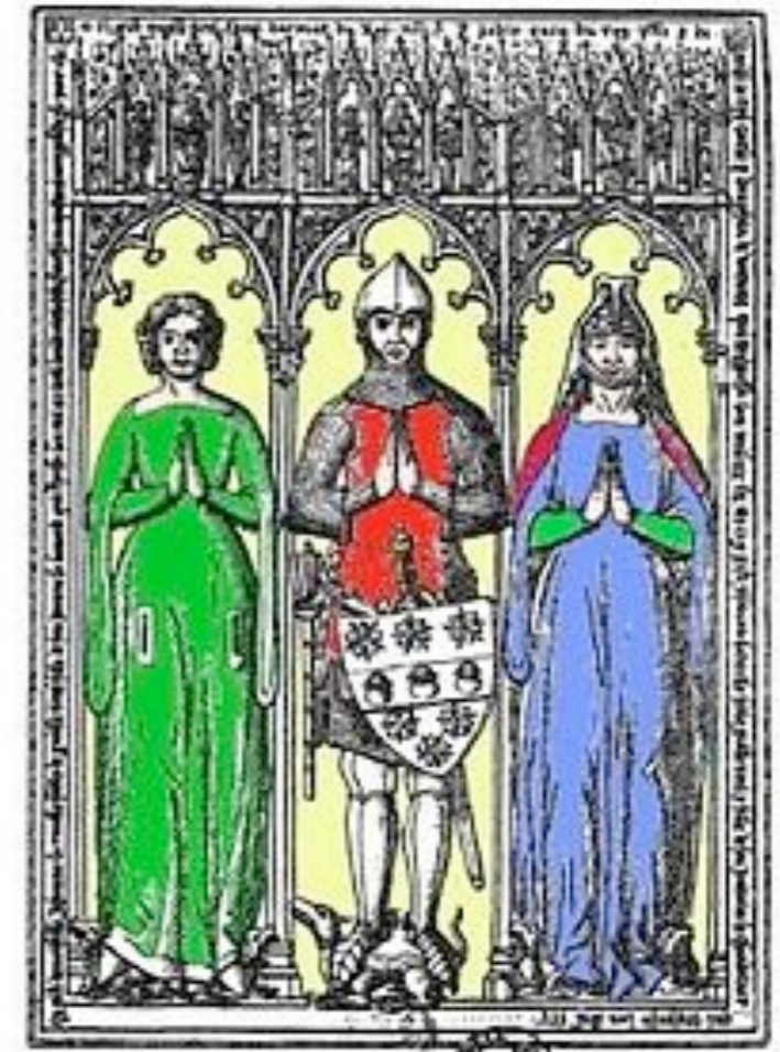
TOMBE de pierre au milieu de la chœur de l'église du Prieuré d'Haumont.

Taillevent helped start the modern favoring of Burgundy and strong (dry) red wine.