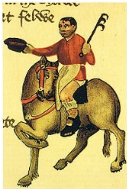
The disreputable cook from Geoffrey Chaucer's Canterbury Tales .

laid out harsh punishments for brewers and bakers who were caught cheating.