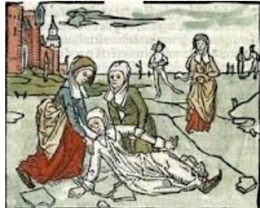
starving mystic Blessed Lidwina

Lenten food restrictions dominated the spring for Medieval Christians