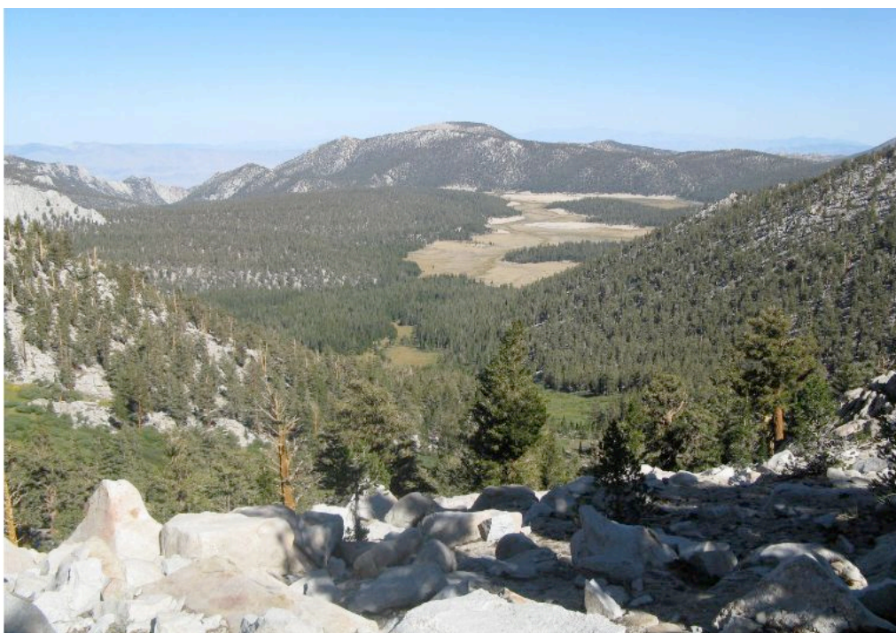
Looking down at Horseshoe Meadow from Cottonwood Pass.