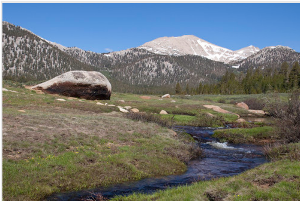
Creek in Horseshoe Meadow with Cottonwood Pass and "Trailmaster Peak" in the distance.