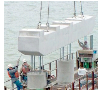
Figure 3: Precast highway bridge construction

However, each of these technologies has been demonstrated for ECC containing virgin materials. Green ECC mixes incorporating wastes such as waste carbon nano-particles have yet to be developed with this variety of processing functionality. Initial research will focus on imparting such versatility on green ECC while not sacrificing the unique material properties (i.e. tensile ductility, etc.) necessary for durable infrastructure. Additionally, preferred