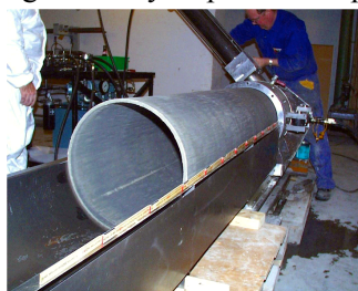
Figure 6: Extruded ECC Pipe

While reinforced concrete can be either cast-in-place in the field or precast in large molds, ECC is uniquely suited for prefabrication due to a variety of potential processing methods. Such processes can significantly improve the speed and efficiency of prefabrication, thereby enhancing sustainability through