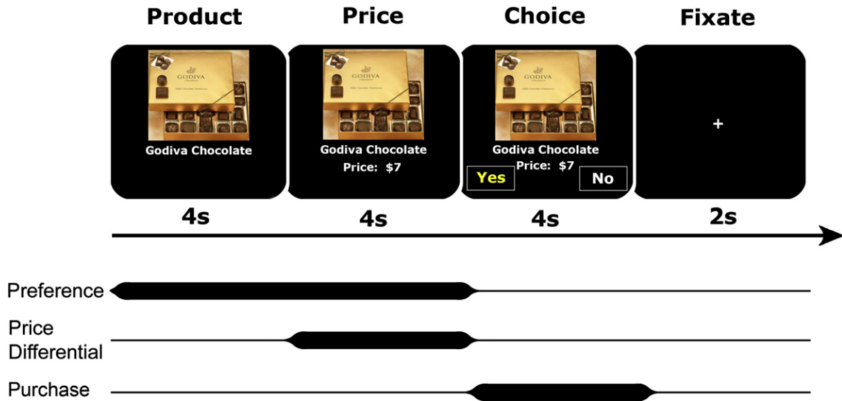
Figure 1. SHOP Task Trial Structure and Regressors

For task structure, subjects saw a labeled product (product period; 4 s), saw the product's price (price period; 4 s), and then chose either to purchase the product or not (by selecting either "yes" or "no" presented randomly on the right or left side of the screen; choice period; 4 s), before fixating on a crosshair (2 s) prior to the onset of the next trial. In regression models, preference was correlated with brain activation during the product and price periods, price differential was correlated with brain activation during the price period, and purchasing was correlated with brain activation during the choice period.