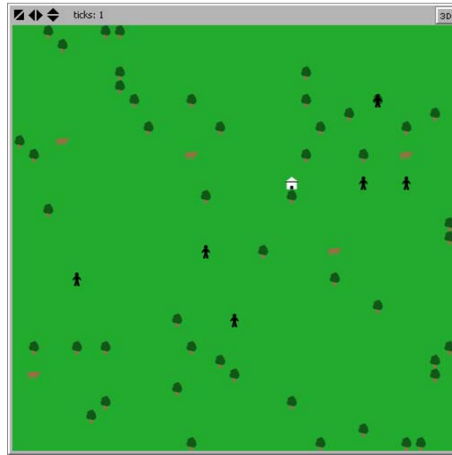
Fig. 3. A sample simulated environment using NetLogo