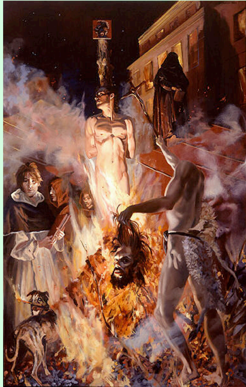
Bruno burned for heresy