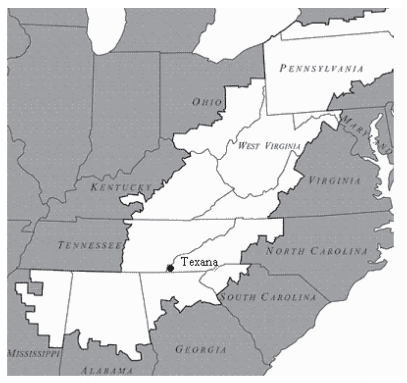
Figure 1: Location of Texana, North Carolina, within the Appalachian region of the US

Texana is the largest black Appalachian community located west of Asheville, North Carolina; its location in the Appalachian region of the US is indicated in Figure 1. Details about Texana are few and far between, documented only in some local histories. The most consistently documented part of the Texana story is how the community got its name. Around 1850, a black family from a neighboring part of the state settled in the area and named the developing community after their daughter, Texana. Currently, around 150 residents live in Texana, in approximately 65 households. Many Texana residents have African, Cherokee, and Irish-European ancestors, which is the case for most Appalachians of color (Dunaway 2003). As a result of their mixed ancestry, many Texana residents feel that their heritage is often more diverse than the single term 'African American' denotes. As a result, many Texanans call themselves 'black,' which they say is a designation based on the color of their skin rather than on any one ethnic identity.<sup>2</sup>