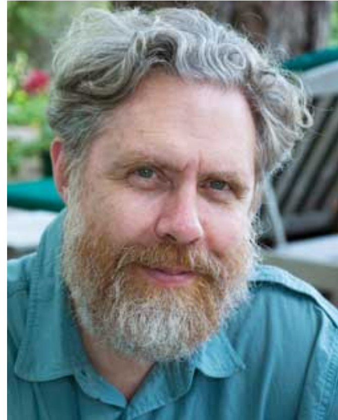
George Church, Harvard Geneticist