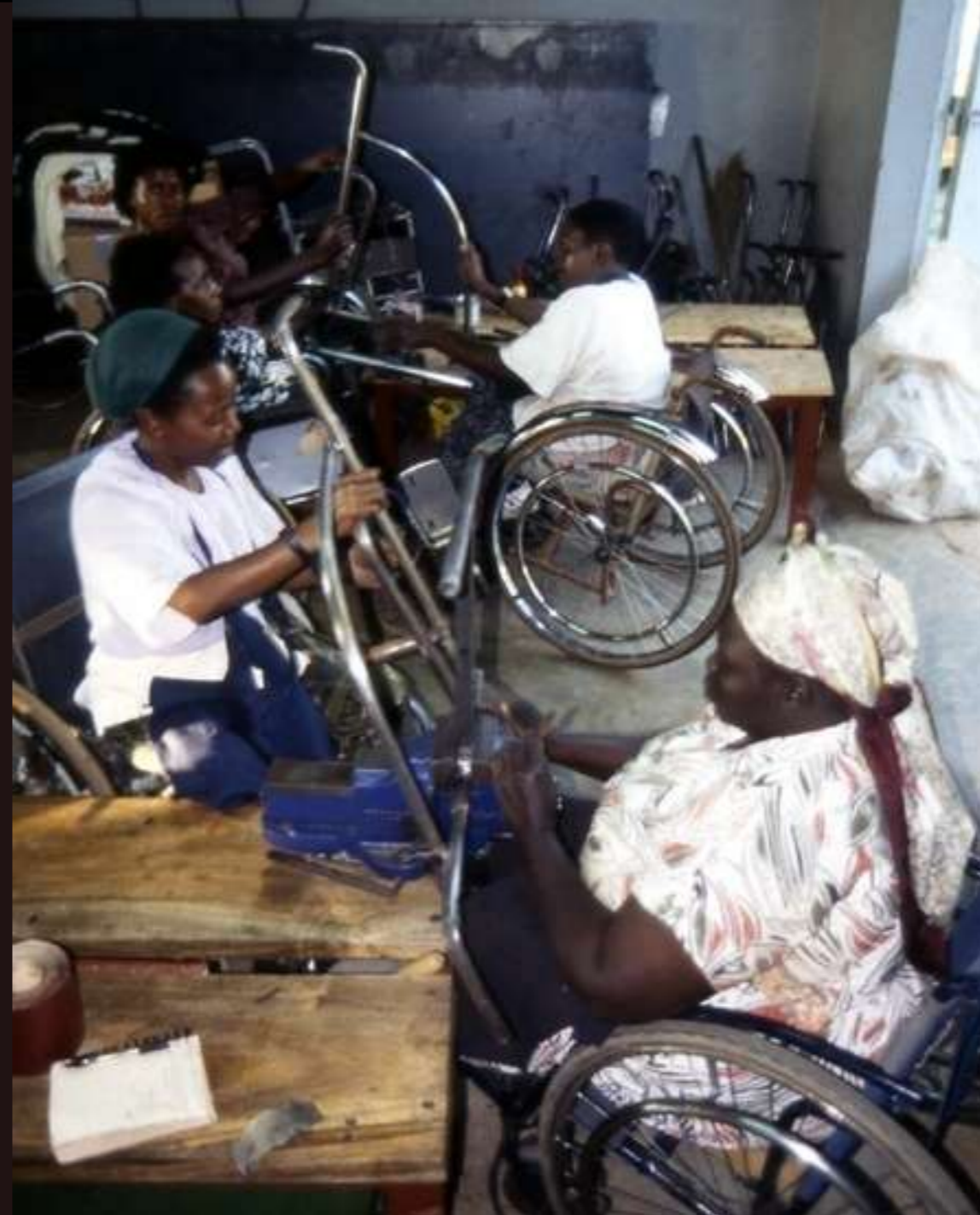
Women wheelchair riders building wheelchairs in Uganda – circa 1998