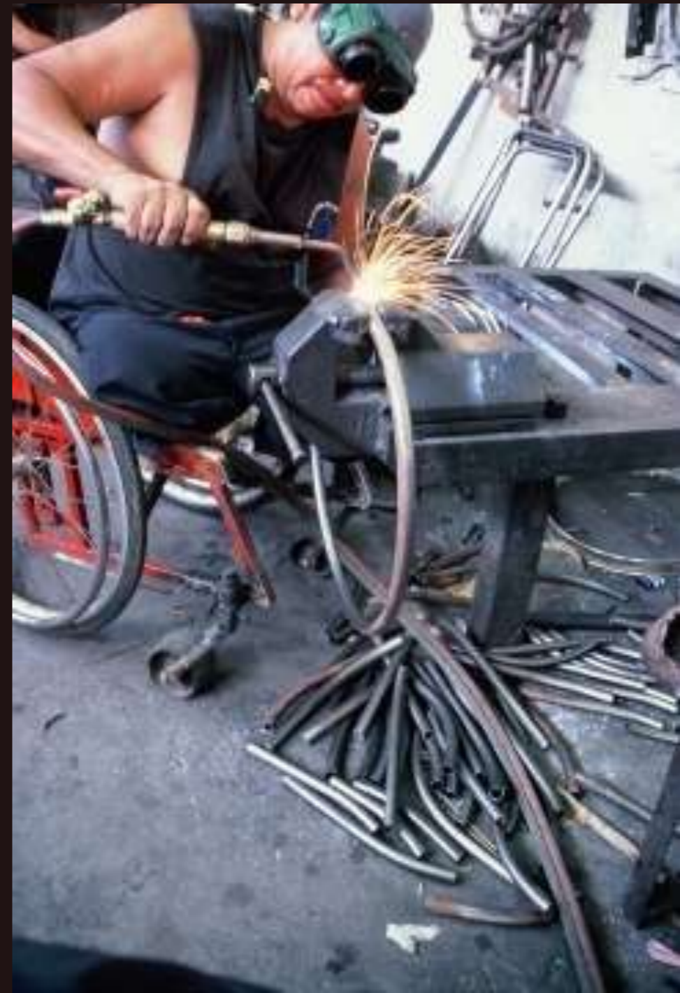
Double amputee building wheelchairs in Nicaragua – circa 1995