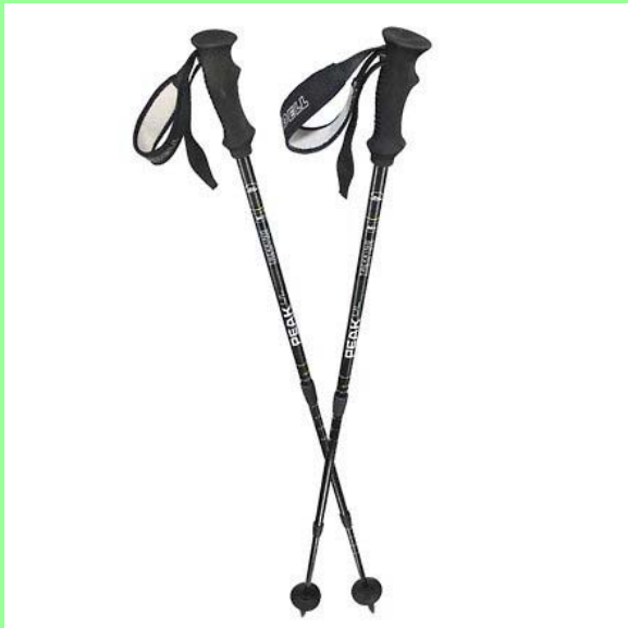
Hiking Poles/Walking Sticks