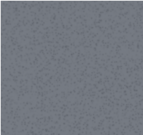
Example part of skins shader: pores generated with vornoi texture