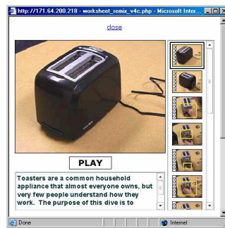
Figure 1b. Toaster video dive.