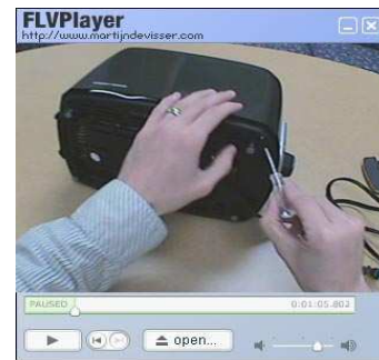
Figure 1c. Toaster video from a head-mounted camera.

After the participants in each of the conditions have reviewed their materials, a series of assessments are administered. Each of these assessments target a different form of knowledge or understanding in order to determine if different types of video interactions support different kinds of learning. Participants are asked to complete four tasks: (1) Answer a series of paper-based conceptual and vocabulary questions (e.g. “Why are the filaments in a toaster wound more tightly at the bottom than at the top?”) (2) Describe how a toaster works to someone who doesn’t know (3) Describe how they would troubleshoot a series of hypothetical toaster malfunctions (e.g. “The toaster is plugged in and the tray stays down, but my bread isn’t heating up.”) and (4) Draw a functional diagram of a toaster.